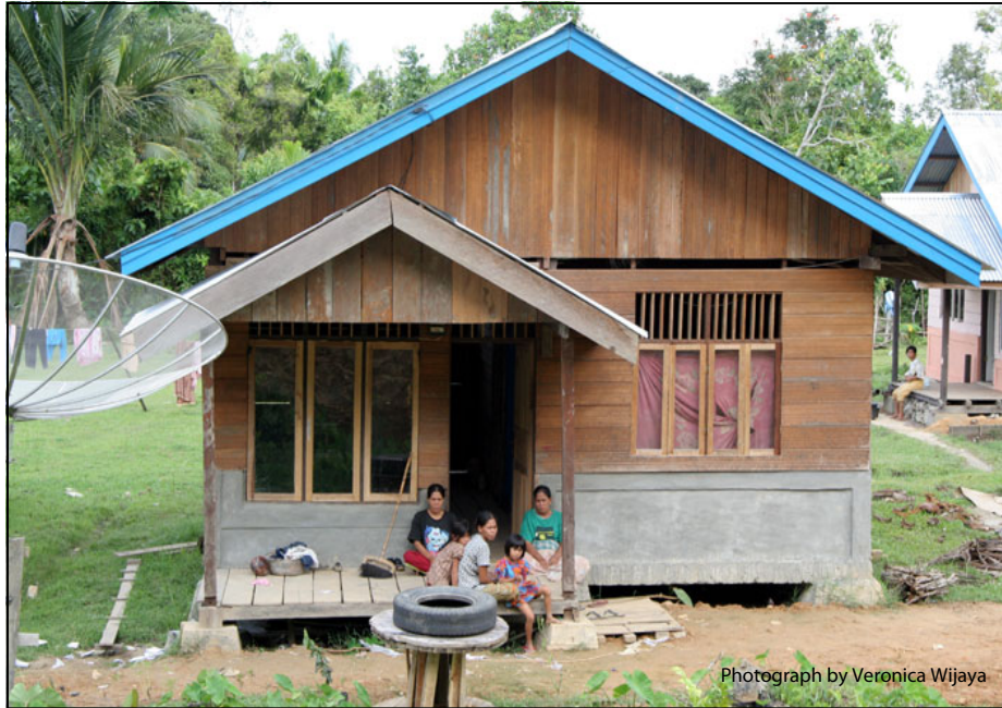
Fresh start: a family spend time together outside their new home in Simeulue.

F or many families living in Western Simeulue, this year will bring something they've longed for since the tsunami – a new home.