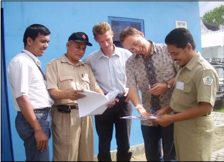
Meeting time: TRWMP team members with workshop participants

Gathering feedback on any project is essential. And understanding the needs of partners working in the field is just as important. With this in mind, the UNDP Tsunami Recovery Waste Management Programme (TRWMP) created a simple but effective way of exchanging knowledge, and updating government partners old and new.