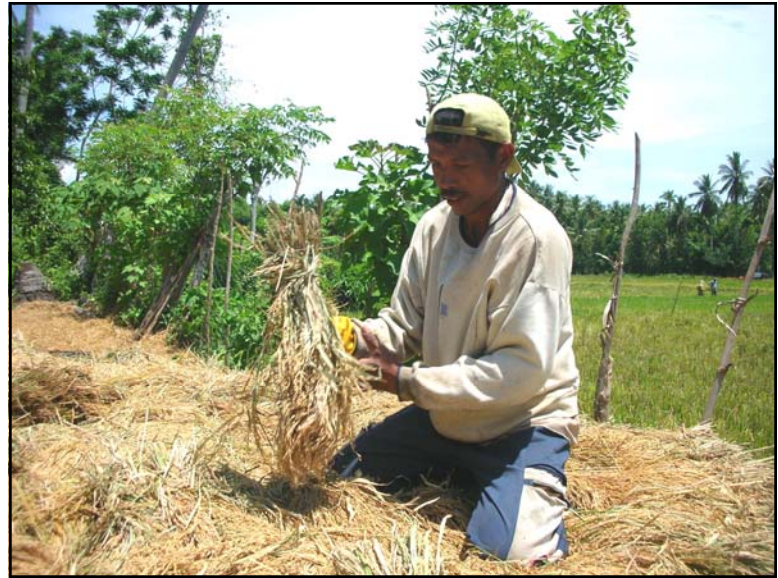
Reaping the benefits: a local farmer enjoys the results of his harvest

"But we don't just stop at seed and equipment – we also give farmers monitoring and guidance through technical advice, and advice on how to mobilize themselves.