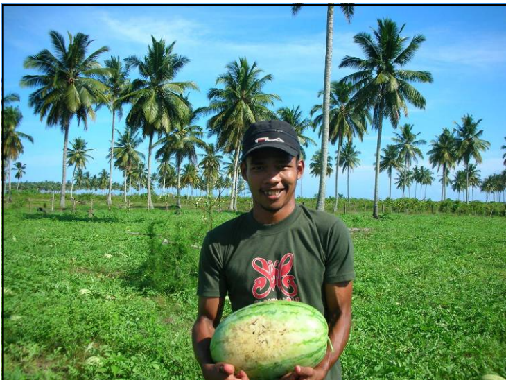
Results: beneficiaries are seeing the fruits of their labour.