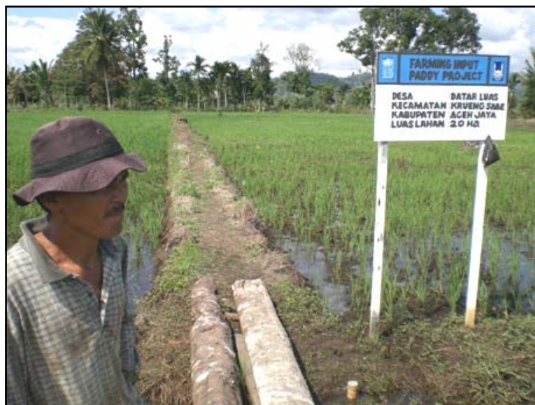
Pre-harvest: a local farmer watches over his paddy fields in Krueng Sabee

The project is also focusing on food security through the provision of tools, fertilizers, herbicides, land cultivation costs, and a particular seed that harvests quicker than normal seed.