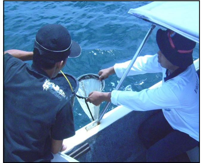
Measuring the impact: carrying out EIAs on sea and land (below)

"We also assess socio-cultural aspects to understand the advantages or disadvantages for the local community. For example, a commercial port cannot be recommended in an area if it has more potential as a fishing port. That's why we need to ensure the EIAs cover all needs of the environment and community."