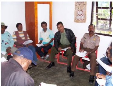
Peace Discussion in Wamena on 21 September 2006, the International Peace Day