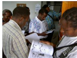
Opening of the Peace Education Library in Wamena