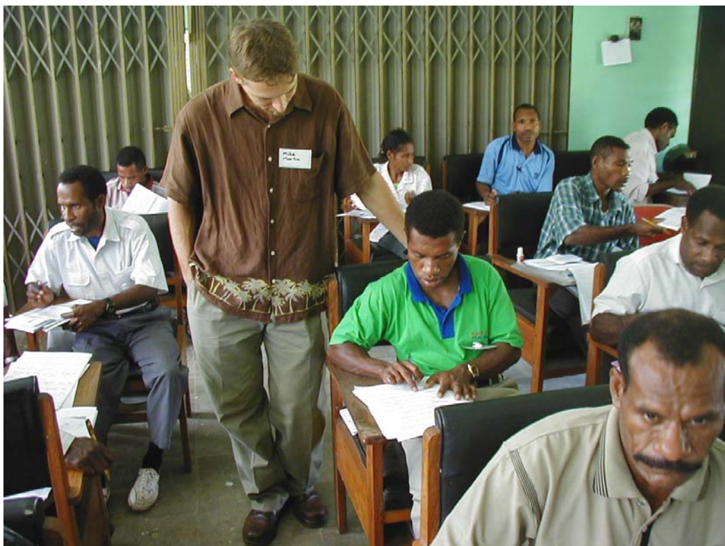
Figure 1. Participants of Mother Tongue Translation Workshop