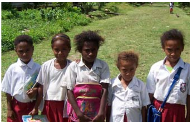
Improving education is a critical component of the People-centred Development Programme in Papua.

Improving development knowledge networking , by establishing local Community Resource Centers as hubs of development information, technical support for development activity and networking among community and government stakeholders.