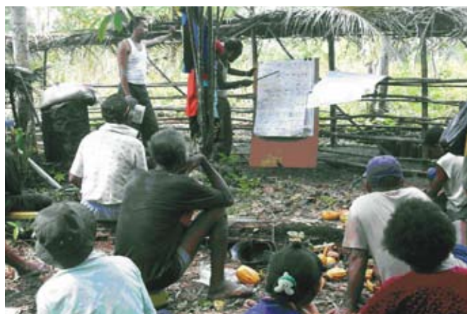
Involving community members in decision making processes helps to ensure long-term sustainable development.

The Papua region (West Papua and Papua provinces) presents one of Indonesia's greatest development challenges. High incidence of poverty, poor performance against the United Nations' Millennium Development Goals (MDGs), limited access to basic health and education services, and geographical isolation combine to make human development both pressing and challenging.