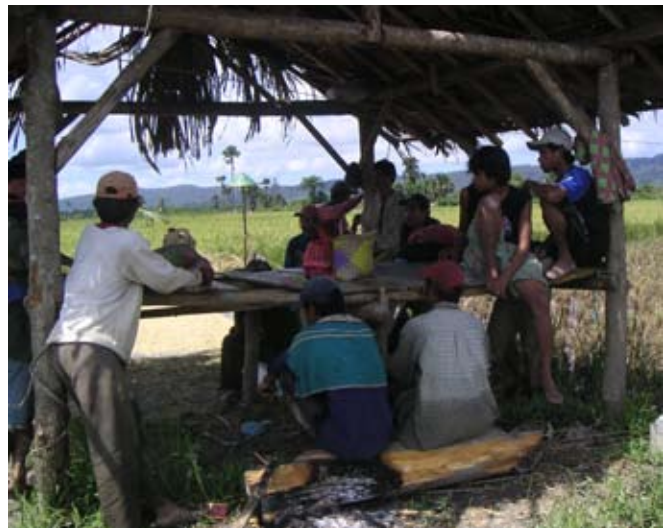
Open forums for discussion help to ensure transparency and community empowerment.

The LEAD Project builds on a 2005-2006 joint assessment by the National Development Planning Agency (BAPPENAS) and UNDP of access to justice in the five Indonesian provinces of West Kalimantan, Maluku, North Maluku, Central Sulawesi and Southeast Sulawesi. Throughout these provinces, the assessment found that economic concerns presented the strongest access to justice challenges, a reflection of priorities in many Indonesian communities where daily life often revolves around maintaining an adequate livelihood.