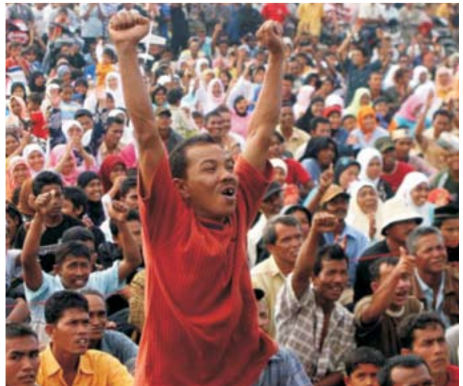
When members of the public realize their basic human rights, they are empowered to protect those rights.

little legal information or assistance has ever previously been made available. From April to June 2008 alone, LEAD's partners distributed 14,000 posters and leaflets on legal rights; trained 400 paralegals and citizen advisors; held community discussions on legal issues with 13,700 villagers; produced 2,200 advertisements in radio, TV and print on legal rights, and provided legal counseling and support for 88 cases.