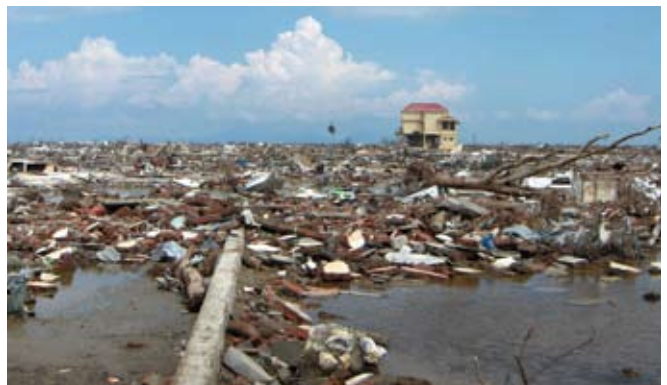
Natural disasters in Indonesia exact a devastating toll, but preparation can help to lessen the impact and ensure faster recovery.

regulatory framework that is integrated with decision-making on development planning, at the national, provincial and district levels; and the development of supporting legislation, policies, procedures, budgets, regulations, incentives, disincentives and enforcement processes. These include but are not limited to: