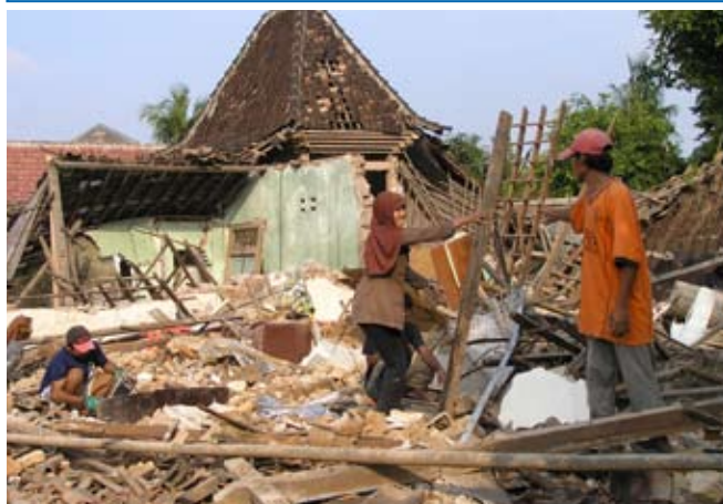
Disaster risk reduction helps to ensure that, next time, communities are better prepared.