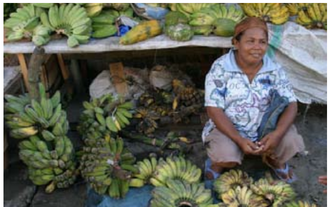
A return to peace in the Malukus has also signaled a return to economic growth.