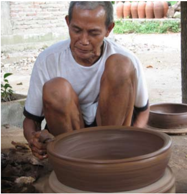
Livelihoods support helps to ensure people are back to work and back on their feet.

Information System (MIS) staff to support data collection and mapping for coordination and monitoring purposes as well as simple monitoring system. In each of the ERA components, support was also provided to coordinate sector activities such as through livelihood, DRR and community-based DRR working group.