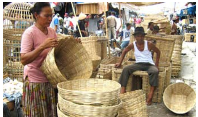
Livelihoods support in earthquake-affected areas helps to ensure quicker recovery.