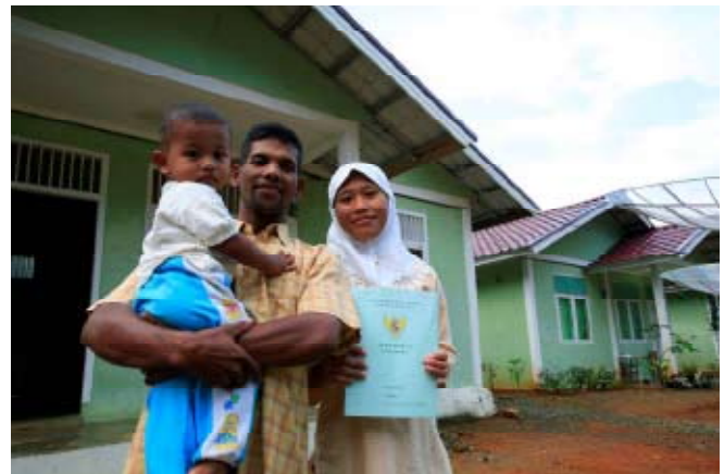
Beneficiaries of the land titling programme

for a second phase of implementation, with the provision of additional resources by the MDF. BRR's mandate will finish in April 2009. Therefore, Phase II of the TA to BRR project continues to provide supplemental technical and operational capacity to BRR during the transition and exit phase.