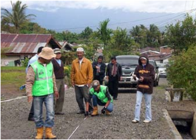
Technical support to BRR focus areas such as GIS mapping is helping to ensure a smoother recovery for Aceh and Nias.

A new joint land titling programme has been initiated at the Relocation Centre in collaboration with the BRR Directorate for Women and Children, in an effort to protect the rights of women and children. Available data confirms that out of the total land titles issued or in process to date (2,767 in total), more than 82 percent