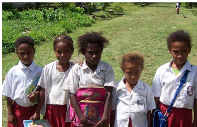
Improving education is a critical component of the People-centred Development Programme in Papua.