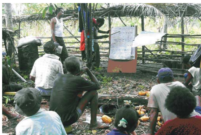
Involving community members in decision making processes helps to ensure long-term sustainable development.

The Papua region (West Papua and Papua provinces) presents one of Indonesia's greatest challenges to reducing poverty and achieving the Millennium Development Goals (MDGs). The most geographically and culturally diverse of Indonesia's regions, Papua has more than 250 indigenous ethnic groups inhabiting mostly rural and remote areas.